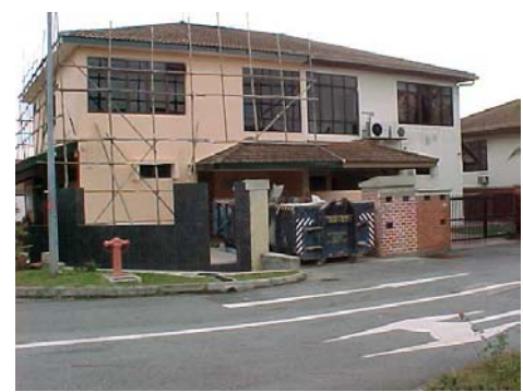
Skip placed within work site - A good practice

3. Skips are commonly used in building construction activities to store and transport construction debris. They should be placed within the work site. However, for the convenience of the work, they are placed along public streets as temporary storage space. This practice has caused safety hazards, obstructions and inconvenience to road users.