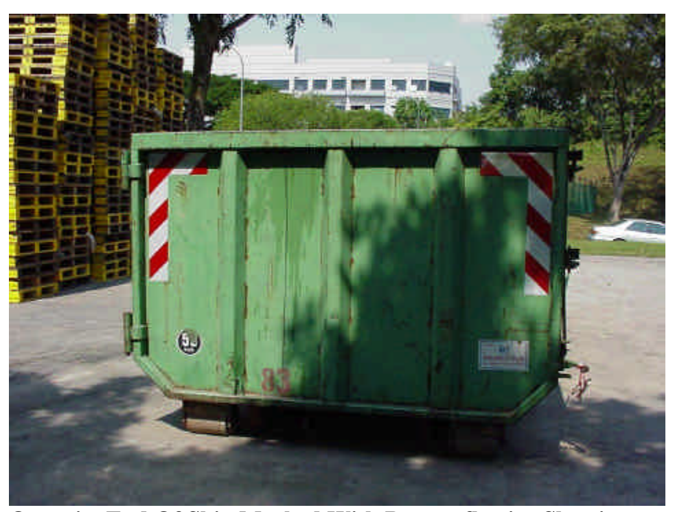
Opposite End Of Skip Marked With Retroreflective Sheeting