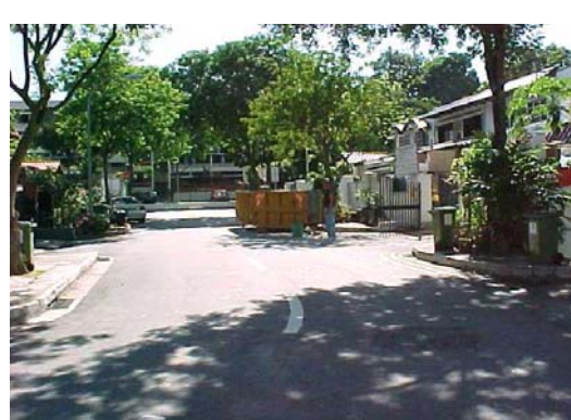
Incorrect retroreflective sheeting - increase risk of accident