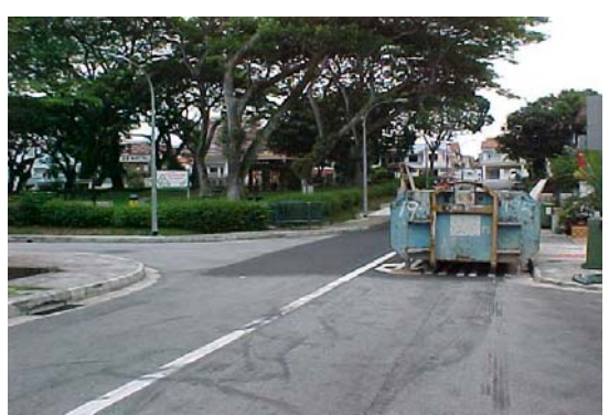
Skip on narrow public street

7. In some instance, skips can also be found along narrow public streets of some private housing estates. These skips reduced the views of road users considerably on traffic in the opposite direction. Furthermore, they block the view of the neighbour driving out of his house. In both situations, the road users are at risk.