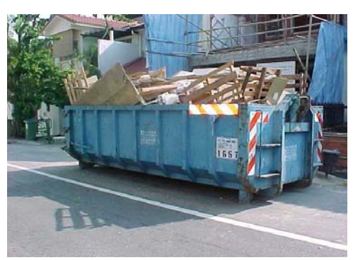
Skip as temporary storage space - Road users at risk