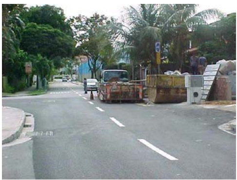
Skip on public street - endanger road users