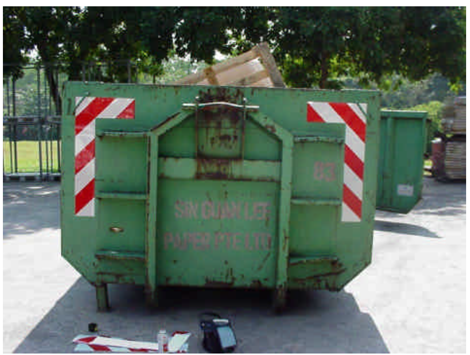
Front View Of Skip Marked With Retroreflective Sheeting

The examples of the shading/hatching of the retroreflective sheeting is as shown in these pictures.