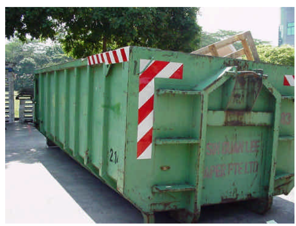
Side View Of Skip With Retroreflective Sheeting