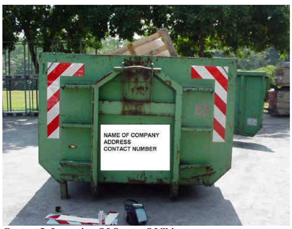
Contact Information Of Owner Of Skip