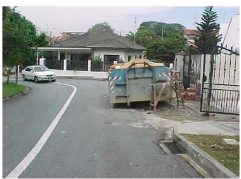
Skip without owner's name and contact number