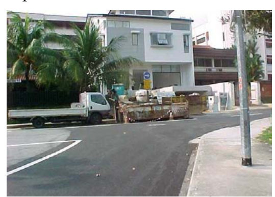
Skip with faded paintwork - increase risk of accident

6. Some of these skips are also un-marked or marked with incorrect type of retroreflective sheetings. These skips are inconspicuous to road users under adverse weather conditions or when placed under the shade of trees. The situation is worsened if the paintwork of the skip is badly faded. Hence, these skips increase the risk of accidents to road users.