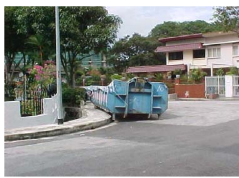
Skip without owner's name and contact number

8. There are also times when the skips do not bear the company name and contact number(s). In an emergency, eg. fire, accident, traffic congestion, etc., the FSSB (Fire Safety and Shelter Bureau), the Police, the LTA, the NEA (National Environment Agency) or anyone would not be able to contact the owner for immediate removal.