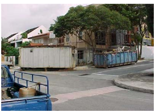
Skip at traffic junction - "Blind Corner" effect

6. Some of these skips are also un-marked or marked with incorrect type of retroreflective sheetings. These skips are inconspicuous to road users under adverse weather conditions or when placed under the shade of trees. The situation is worsened if the paintwork of the skip is badly faded. Hence, these skips increase the risk of accidents to road users.