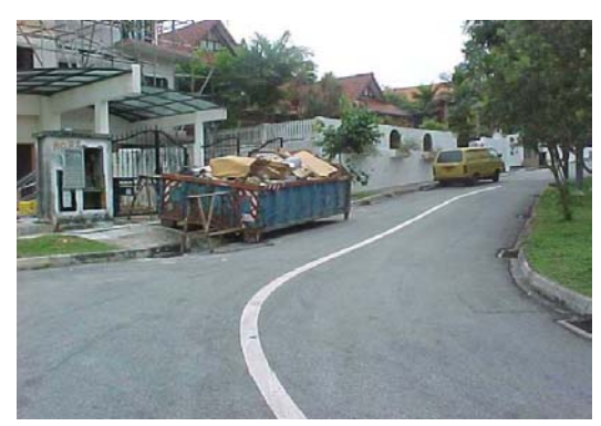
Skip at road bend - "Blind Corner" effect

5. Skips are sometimes found at road bends, traffic junctions and beside parking restriction lines, eg. centre white line, double yellow lines, etc. Placing skips at these locations creates a "blind corner" to road users. This reduces the visibility of road users, thus, increasing their risks to accidents.