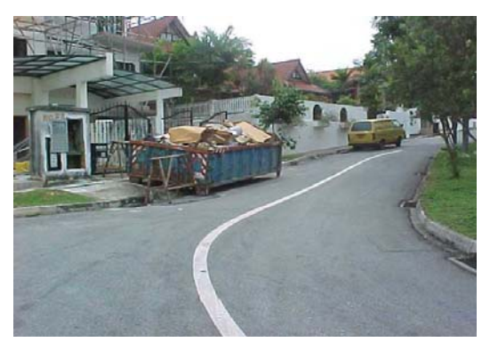
Skip at road bend - "Blind Corner" effect

5. Skips are sometimes found at road bends, traffic junctions and beside parking restriction lines, eg. centre white line, double yellow lines, etc. Placing skips at these locations creates a "blind corner" to road users. This reduces the visibility of road users, thus, increasing their risks to accidents.