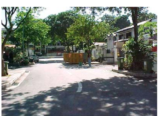
Incorrect retroreflective sheeting - increase risk of accident