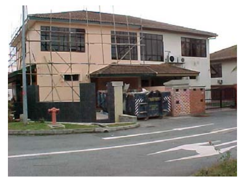
Skip placed within work site - A good practice

3. Skips are commonly used in building construction activities to store and transport construction debris. They should be placed within the work site. However, for the convenience of the work, they are placed along public streets as temporary storage space. This practice has caused safety hazards, obstructions and inconvenience to road users.