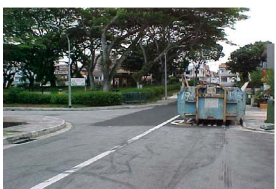
Skip on narrow public street

7. In some instance, skips can also be found along narrow public streets of some private housing estates. These skips reduced the views of road users considerably on traffic in the opposite direction. Furthermore, they block the view of the neighbour driving out of his house. In both situations, the road users are at risk.