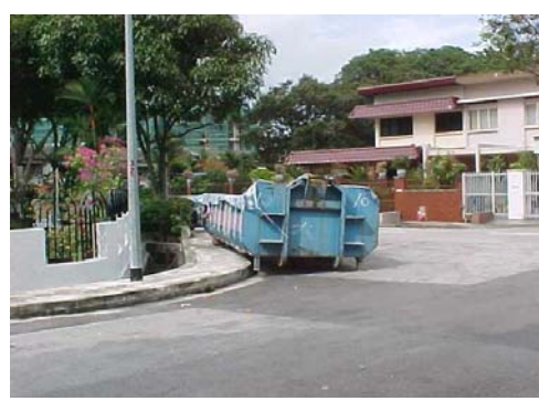
Skip without owner's name and contact number

8. There are also times when the skips do not bear the company name and contact number(s). In an emergency, eg. fire, accident, traffic congestion, etc., the FSSB (Fire Safety and Shelter Bureau), the Police, the LTA, the NEA (National Environment Agency) or anyone would not be able to contact the owner for immediate removal.