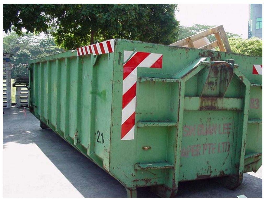
Side View Of Skip With Retroreflective Sheeting