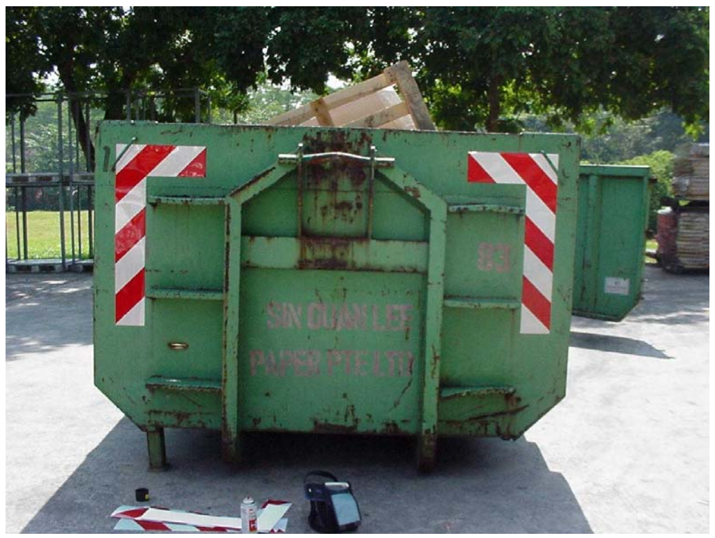
Front View Of Skip Marked With Retroreflective Sheeting

The examples of the shading/hatching of the retroreflective sheeting is as shown in these pictures.