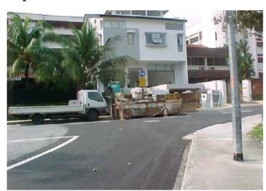
Skip with faded paintwork - increase risk of accident

6. Some of these skips are also un-marked or marked with incorrect type of retroreflective sheetings. These skips are inconspicuous to road users under adverse weather conditions or when placed under the shade of trees. The situation is worsened if the paintwork of the skip is badly faded. Hence, these skips increase the risk of accidents to road users.