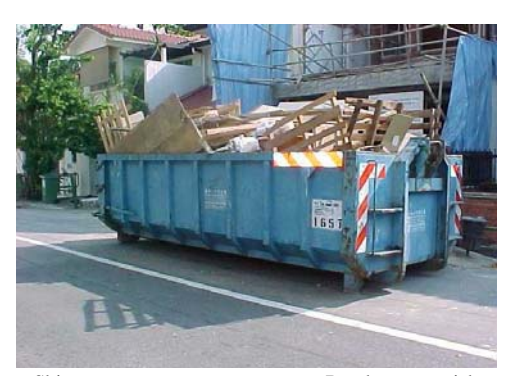
Skip as temporary storage space - Road users at risk