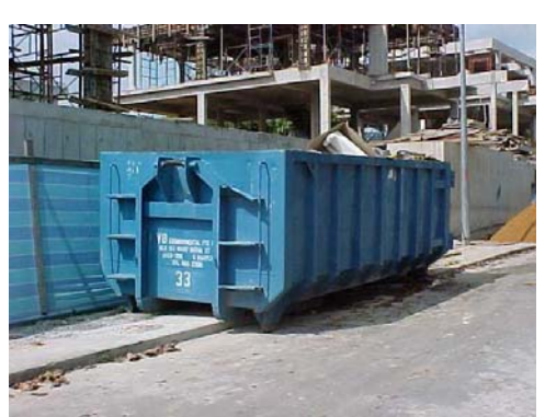
Skip on sidewalk - obstruct pedestrians

4. Skips are used as temporary storage space and have been frequently spotted on the public streets; some for days and some for as long as the duration of the construction/renovation. These practices have caused safety hazards, obstructions and inconvenience to road users.