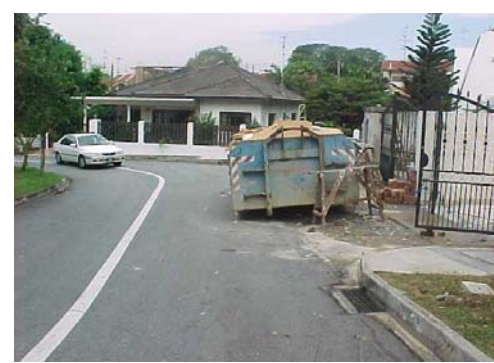
Skip without owner's name and contact number