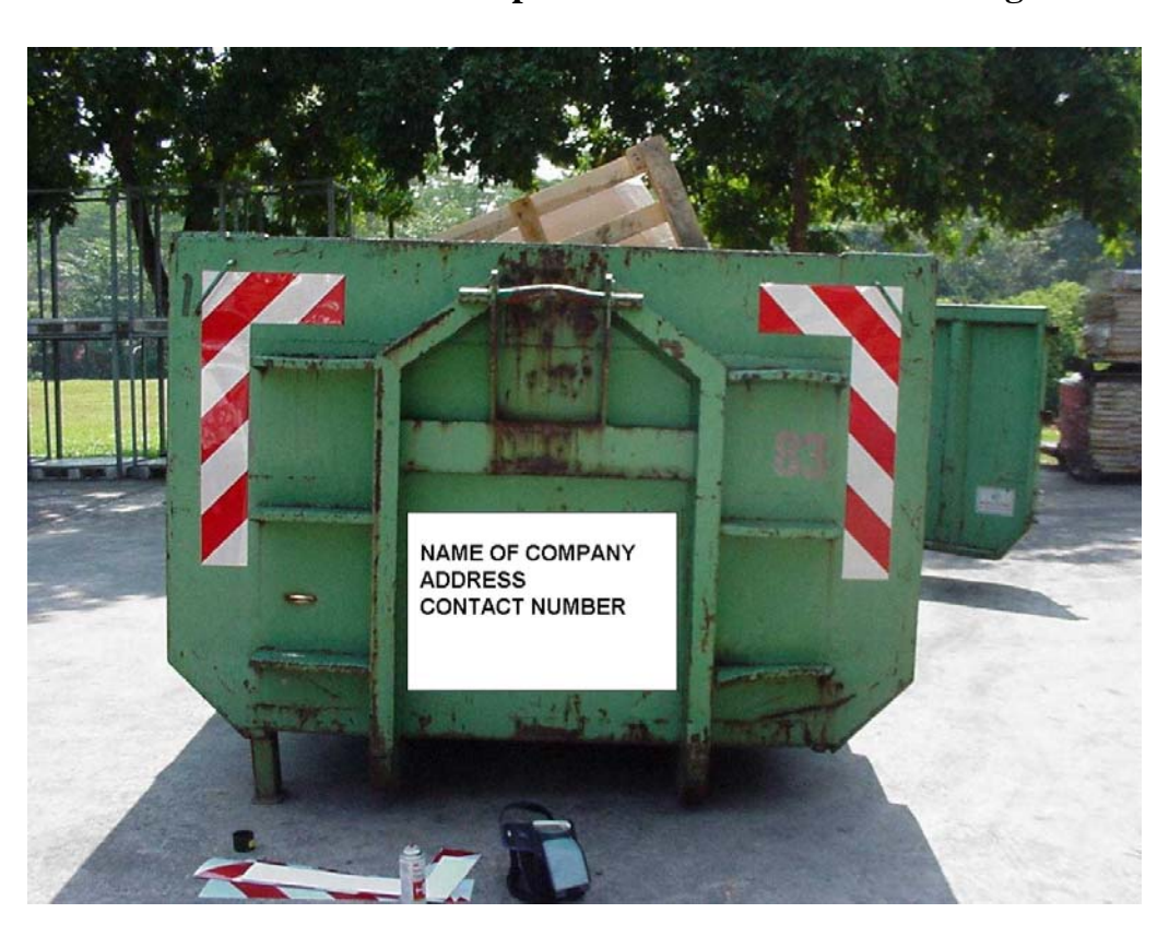
Contact Information Of Owner Of Skip