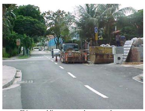
Skip on public street - endanger road users