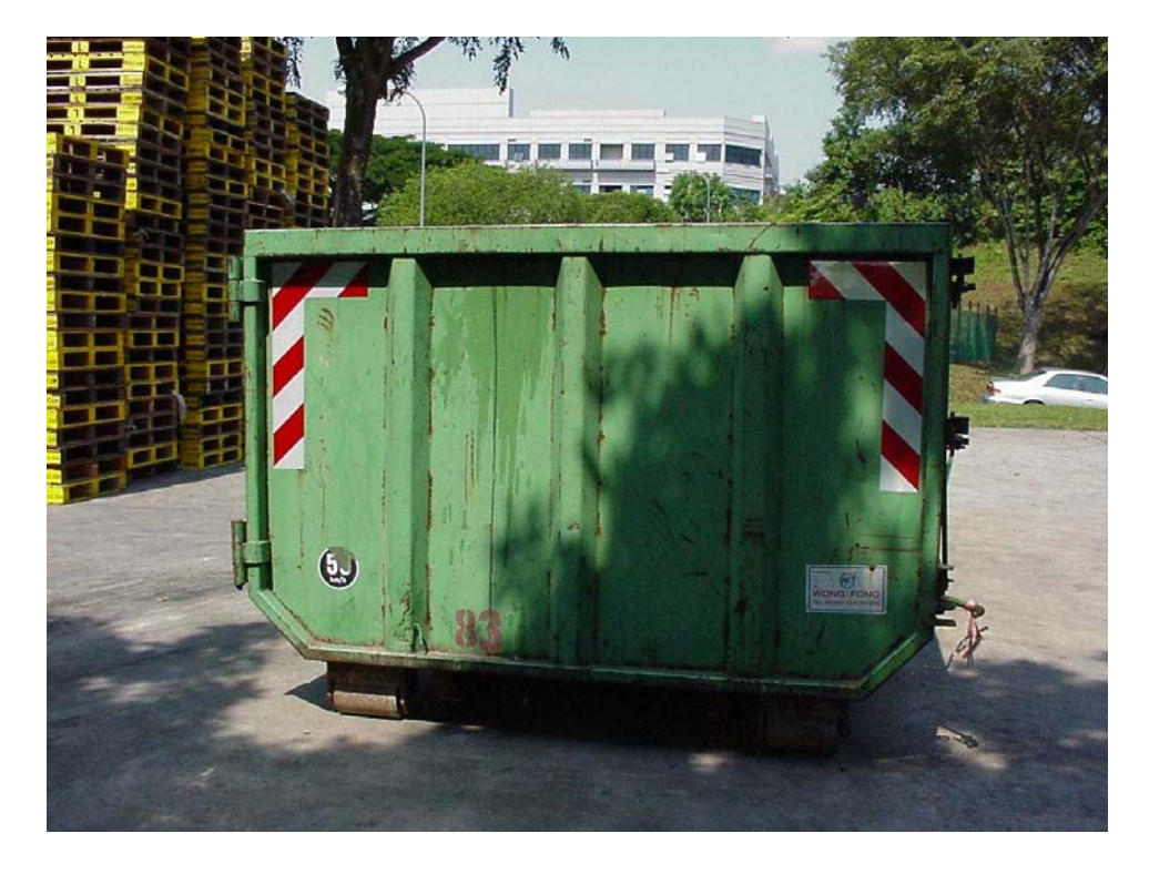
Opposite End Of Skip Marked With Retroreflective Sheeting