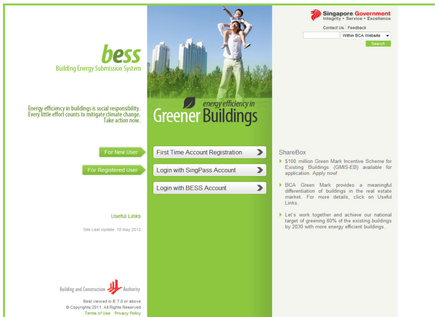
Figure 1: BESS Landing Page