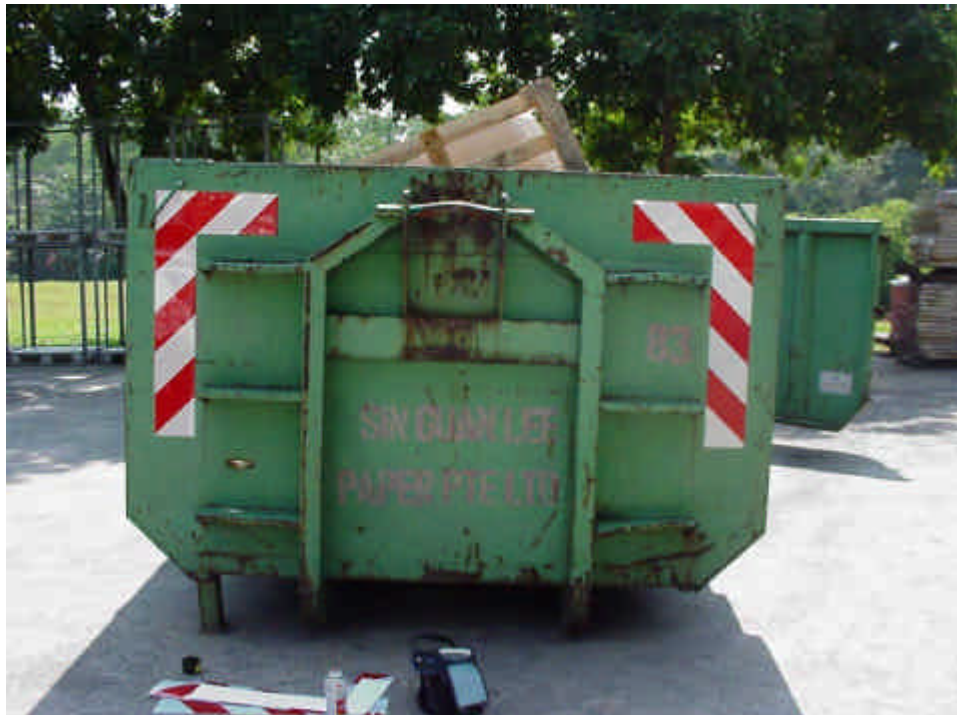
Front View Of Skip Marked With Retroreflective Sheeting

The examples of the shading/hatching of the retroreflective sheeting is as shown in these pictures.