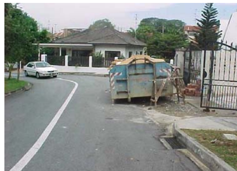
Skip without owner's name and contact number