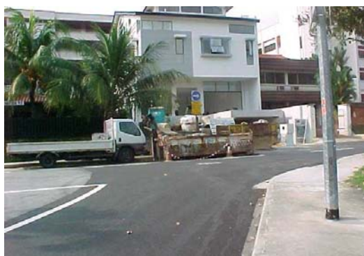
Skip with faded paintwork - increase risk of accident

6. Some of these skips are also un-marked or marked with incorrect type of retroreflective sheetings. These skips are inconspicuous to road users under adverse weather conditions or when placed under the shade of trees. The situation is worsened if the paintwork of the skip is badly faded. Hence, these skips increase the risk of accidents to road users.