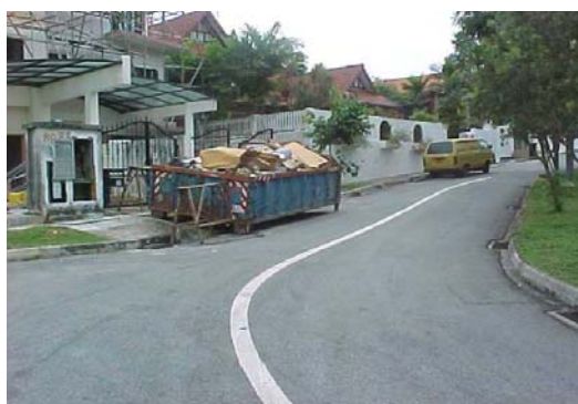
Skip at road bend - "Blind Corner" effect

5. Skips are sometimes found at road bends, traffic junctions and beside parking restriction lines, eg. centre white line, double yellow lines, etc. Placing skips at these locations creates a "blind corner" to road users. This reduces the visibility of road users, thus, increasing their risks to accidents.