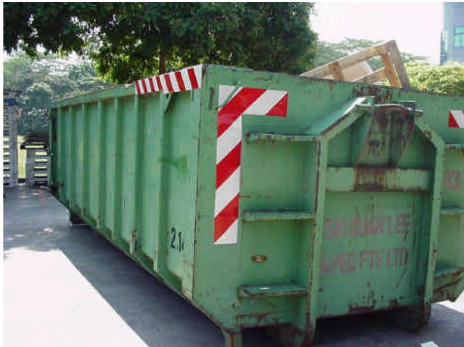
Side View Of Skip With Retroreflective Sheeting