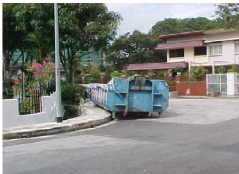
Skip without owner's name and contact number