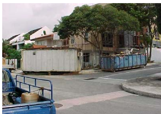
Skip at traffic junction - "Blind Corner" effect

6. Some of these skips are also un-marked or marked with incorrect type of retroreflective sheetings. These skips are inconspicuous to road users under adverse weather conditions or when placed under the shade of trees. The situation is worsened if the paintwork of the skip is badly faded. Hence, these skips increase the risk of accidents to road users.