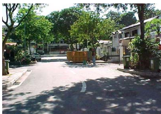
Incorrect retroreflective sheeting - increase risk of accident