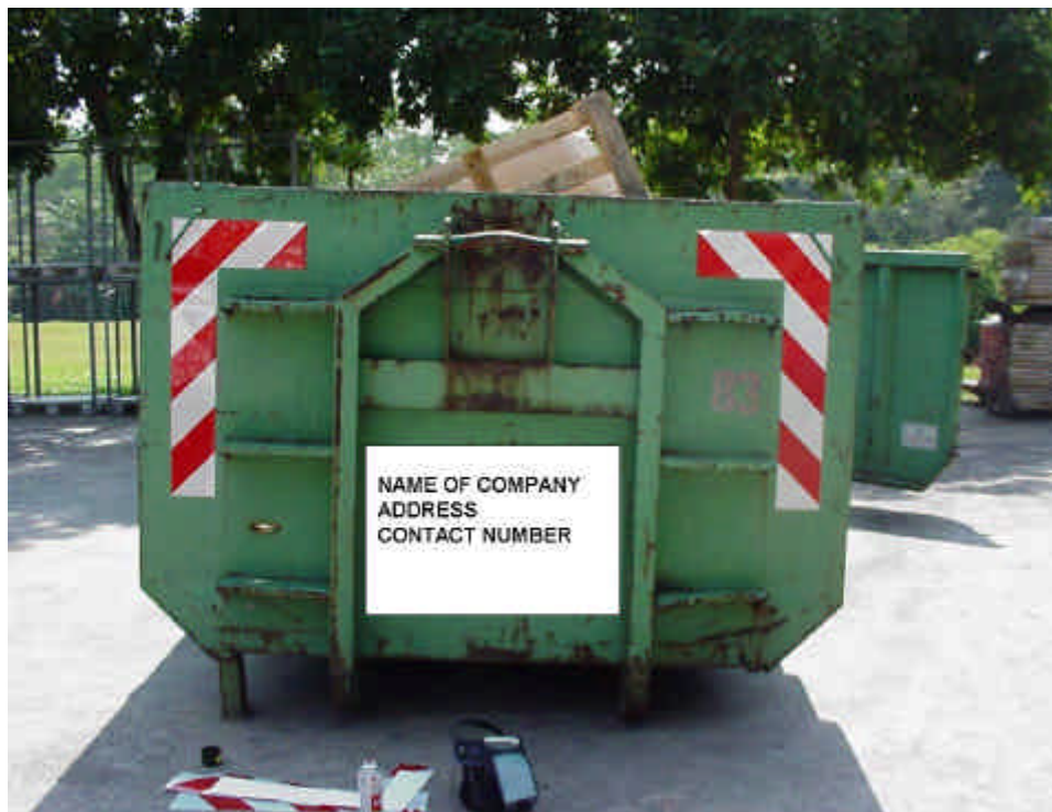
Contact Information Of Owner Of Skip