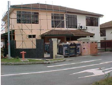
Skip placed within work site - A good practice