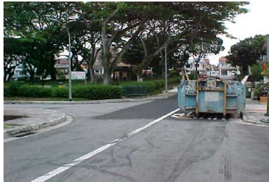
Skip on narrow public street