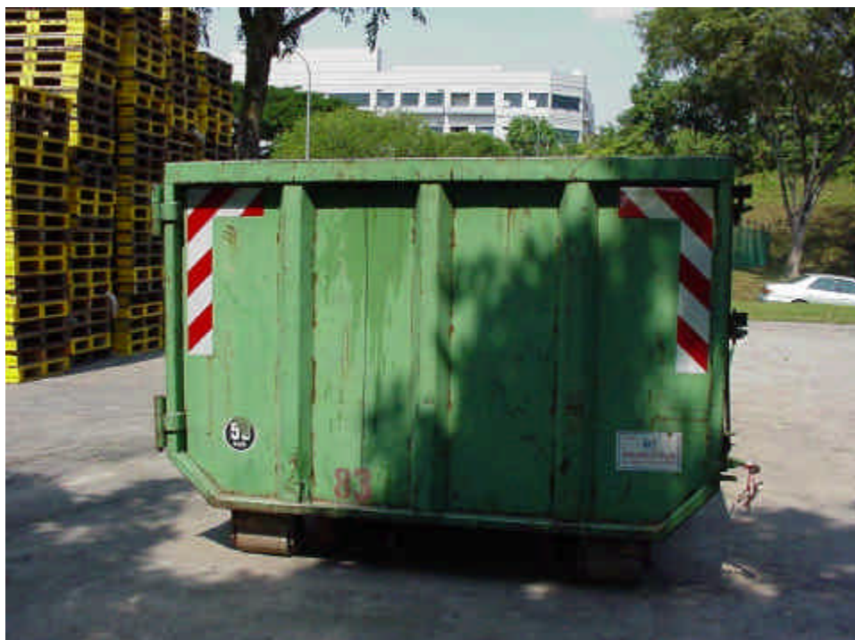
Opposite End Of Skip Marked With Retroreflective Sheeting