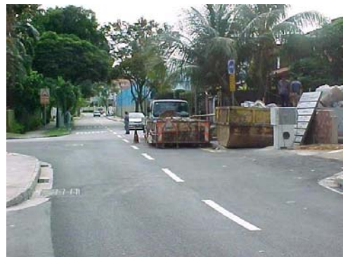
Skip on public street - endanger road users