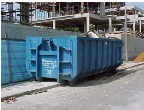
Skip on sidewalk - obstruct pedestrians