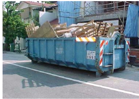
Skip as temporary storage space - Road users at risk