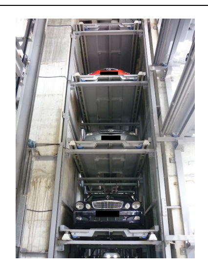
Figure A5 - Structural frame within a building