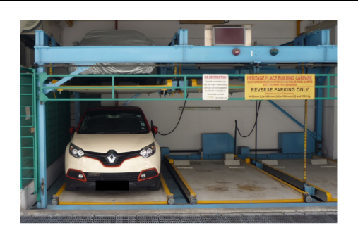
Figure A1 - Structural frame within a building