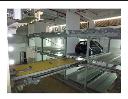
Figure A3 - Structural frame within a building