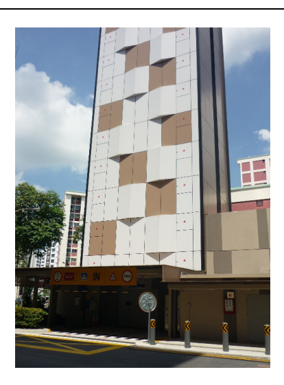
Figure A6 - Standalone structural frame