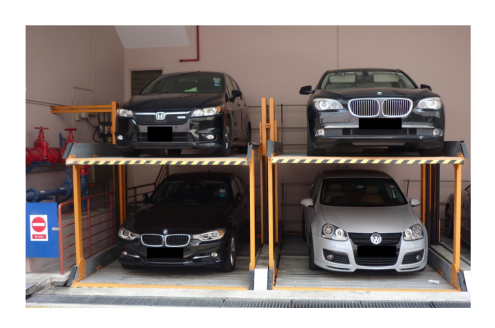
Figure A2 – Structural frame within a building