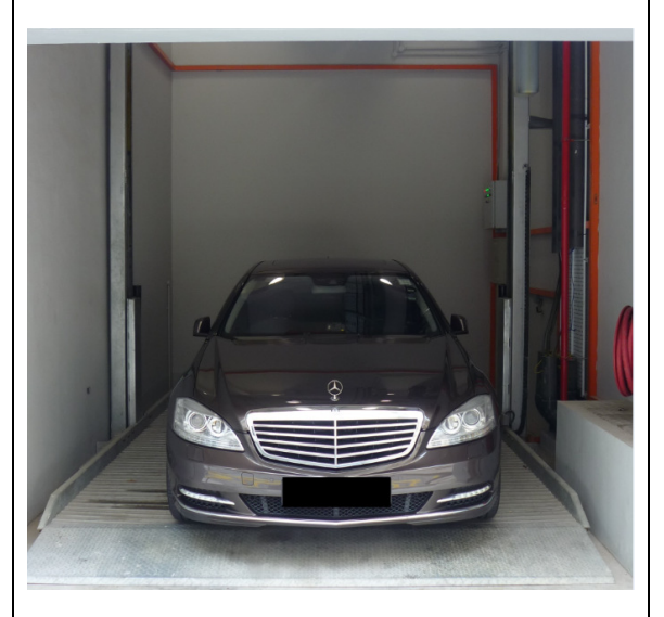
Figure B2 – Lifting system for a single car within a building