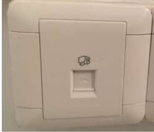
Figure 2 shows the RJ 45* outlet

* NOTE: The CAT 6 cables in the RJ45 outlet shall be terminated into the RJ45 patch panel within the residential unit.