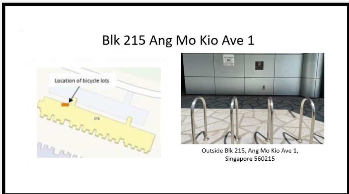
Example of Photo with Description